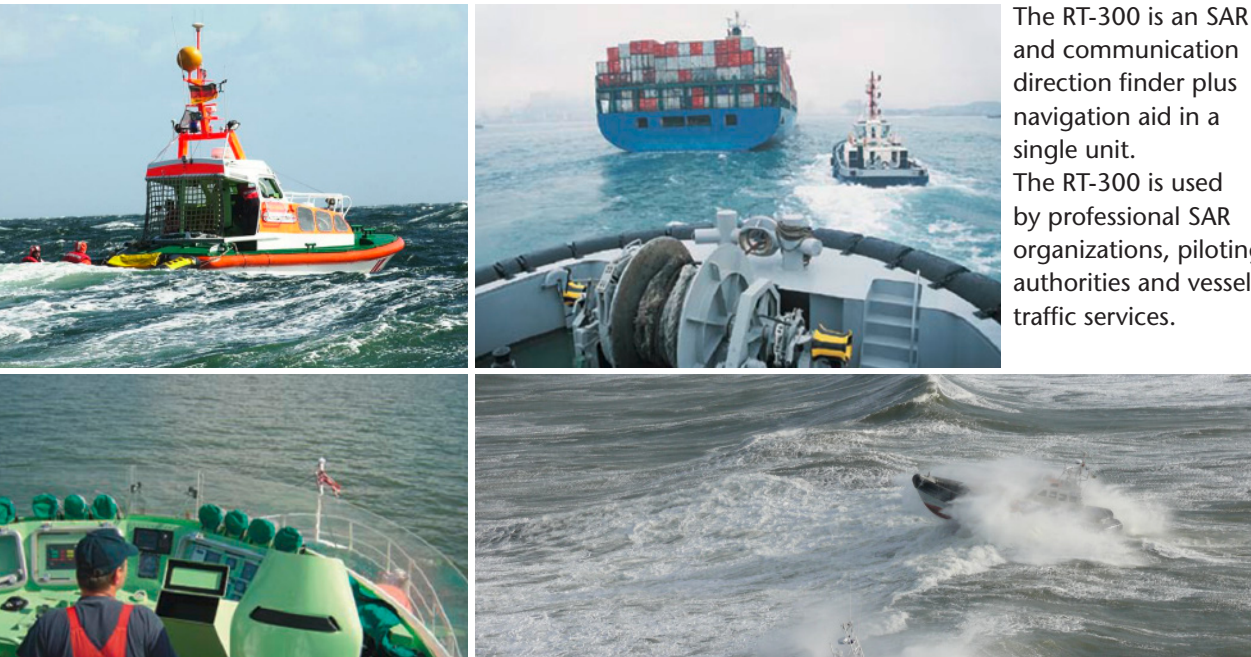
The system is used as a navigation aid and an MOB device to guarantee crew safety on commercial vessels.