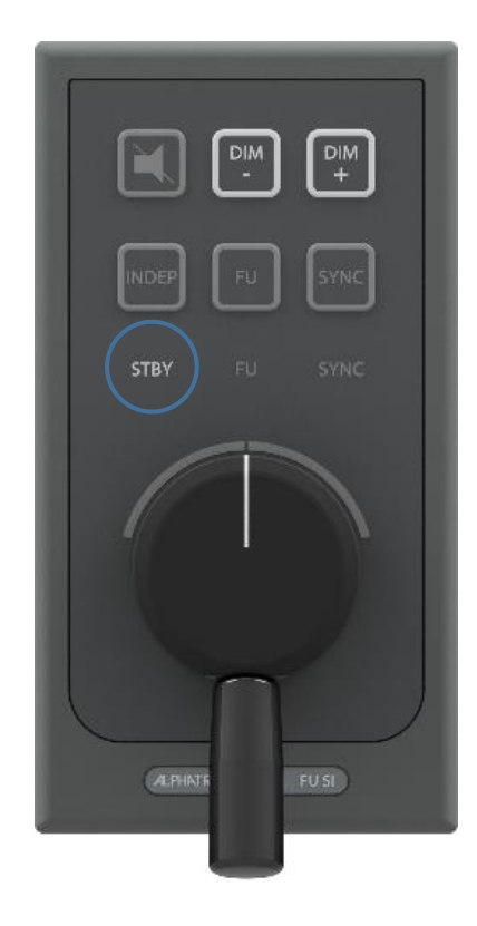
Figure 2: STBY mode enabled

*Note that control must be allowed, see subsection 'Control allowed/not allowed' on page 10. Note that another active controller may need to allow control handover first, see subsection 'Control handover' on page 11.