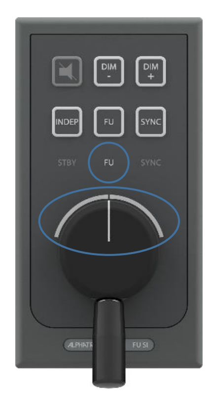
Figure 3: FU mode enabled