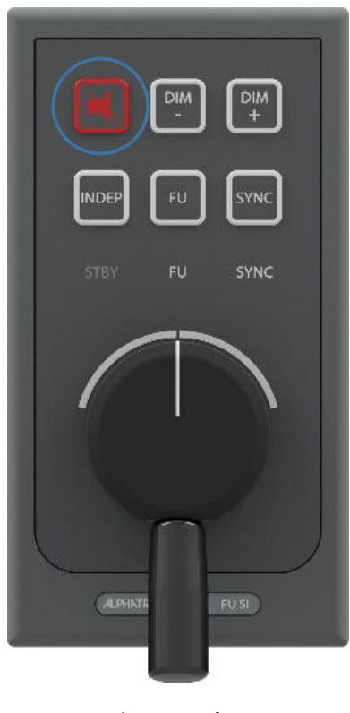
Figure 8: Alarm active

The alarm speaker button is only illuminated when there is an internal alarm. When an alarm occurs, the alarm speaker button will flash in an uninterrupted sequence, and the speaker will beep in an uninterrupted sequence.