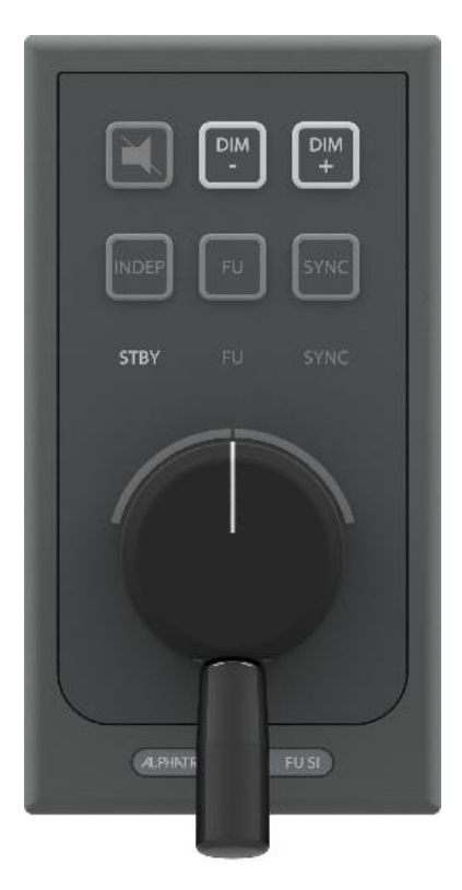
Figure 1: FU Tiller S/I