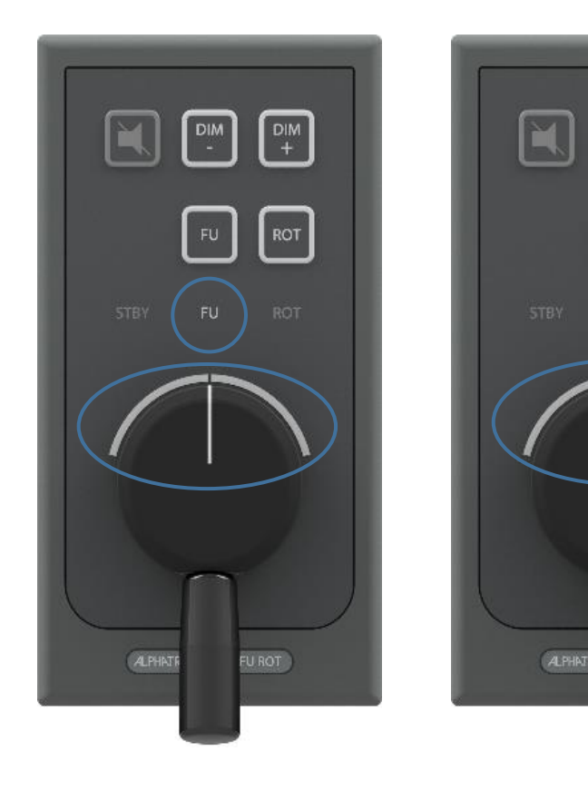
Figure 2: FU mode enabled

*Note that control must be allowed, see subsection 'Control allowed/not allowed' on page 11. Note that another active controller may need to allow control handover first, see subsection 'Control handover' on page 12.