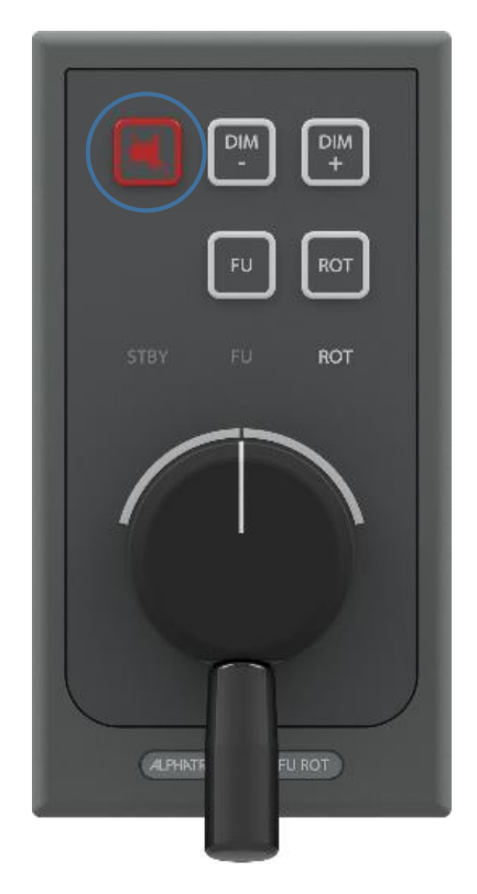
Figure 6: Alert active

The alert speaker button is only illuminated when there is an internal alert. When an alert occurs, the alert speaker button will flash in an uninterrupted sequence, and the speaker will beep in an uninterrupted sequence (see Figure 7: Sound scheme for Alerts).