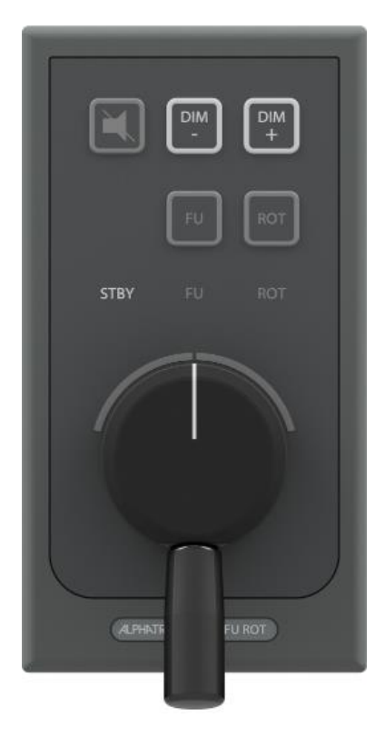
Figure 1: FU Tiller ROT