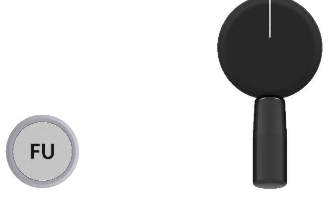
Figure 2: FU Tiller Button