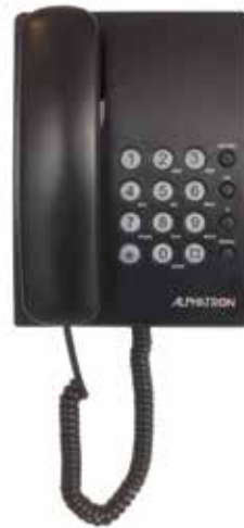
TX500 Cabin station with magnetized handset for wall mounting.