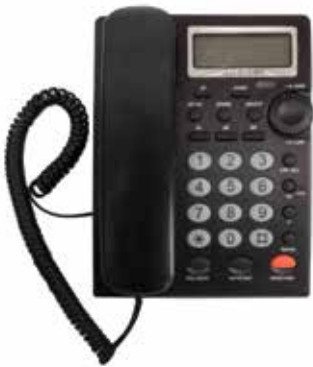
TX251 Cabin station with display, phonebook and hands-free function. Magnetized handset for wall mounting.

The AlphaConnect is using analog telephones or talk balk systems for locations such as cabins or offices, typically dry, and places with room temperature and little to no noise.