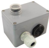
WATERTIGHT OUTDOOR WING RESET UNIT IP66