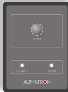
REMOTE RESET BUTTON