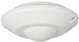
PIR MOTION SENSOR RESET UNIT