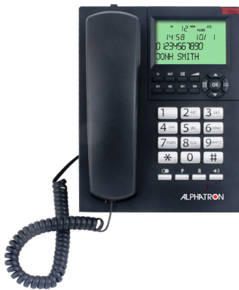
AlphaPhone 100AS Cabin station with display, phonebook and handsfree function. Suitable for wall mounting.

The AlphaConnect Hybrid is using analog and VoIP telephones or digital talkback systems for locations such as cabins or offices, typically dry, and places with room temperature and little to no noise.