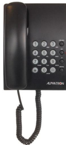
AlphaPhone TX500 Cabin station with magnetized handset for wall mounting.